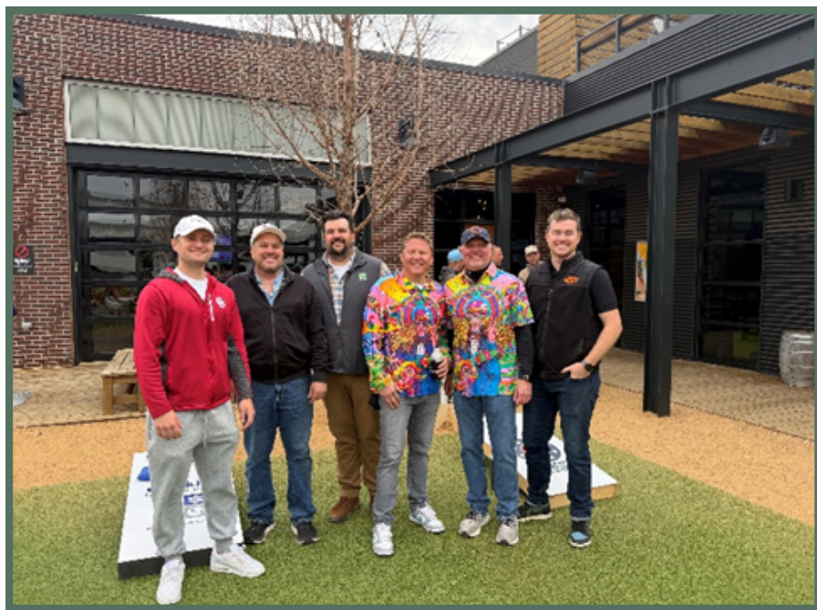
2026 Cornhole Tournament Winners