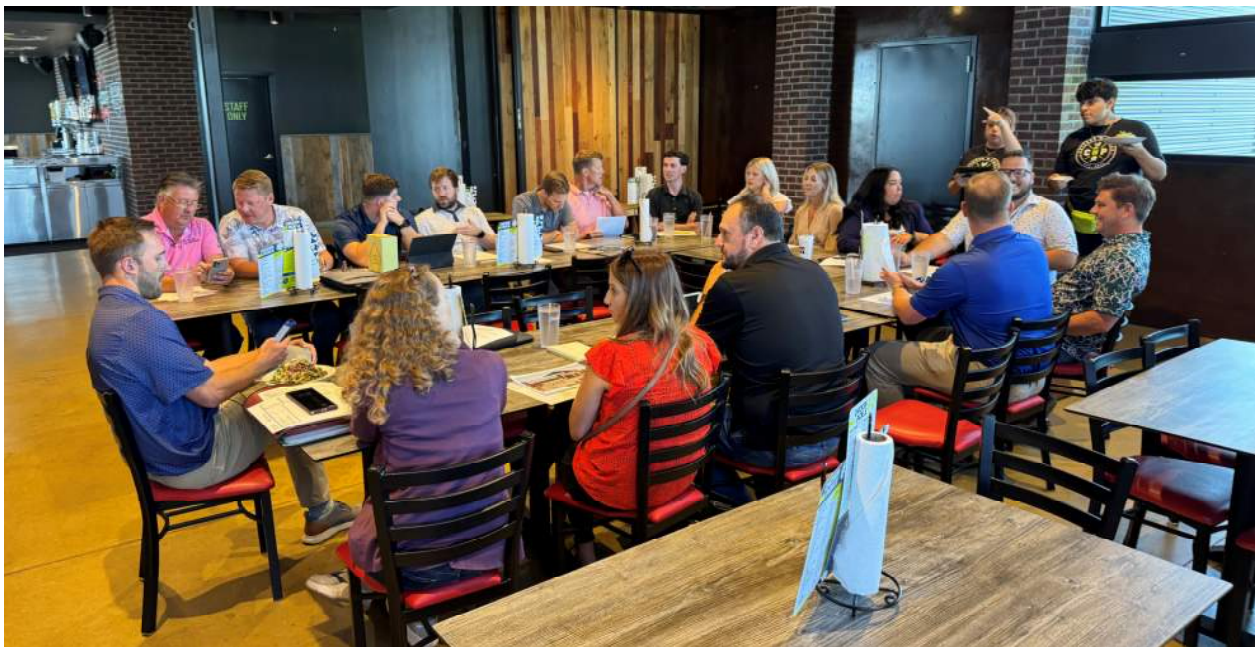
Board of Governor’s Meeting, Chicken N Pickle, August 2024