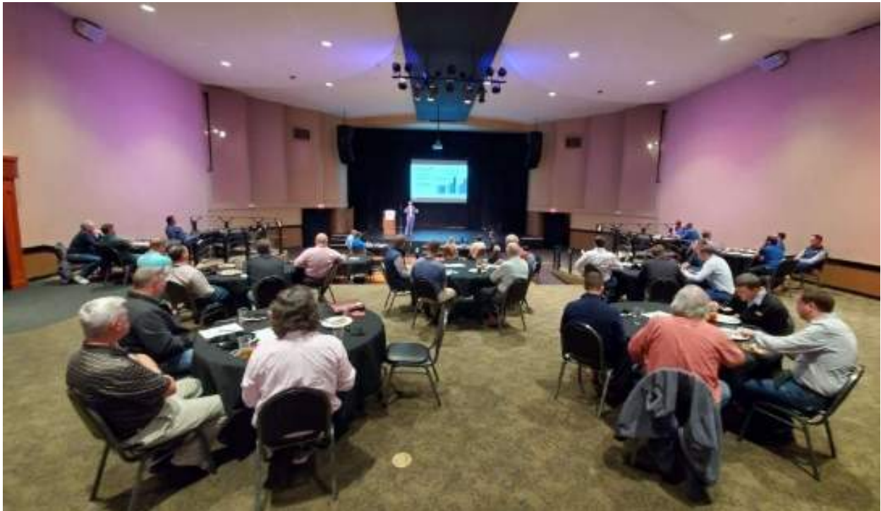
ASHRAE Central Oklahoma Chapter Meeting at Will Rogers Theater

The Student Activities committee remained very active this year despite the setbacks of the pandemic. College campuses were shut down for