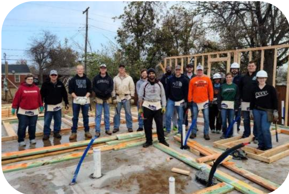
Habitat for Humanity House Framing Work Day

"The most meaningful accomplishment had to be the efforts of all of the chairs. Although we were all dealing with the pandemic, there was nothing stopping them from achieving their goals. I am very appreciative of the hard work everyone put into making the year a successful one! I think the answer to the most challenging is obvious... Covid."