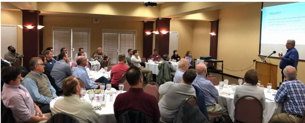
Final Chapter Meeting at 50 Penn Place. January 9, 2019