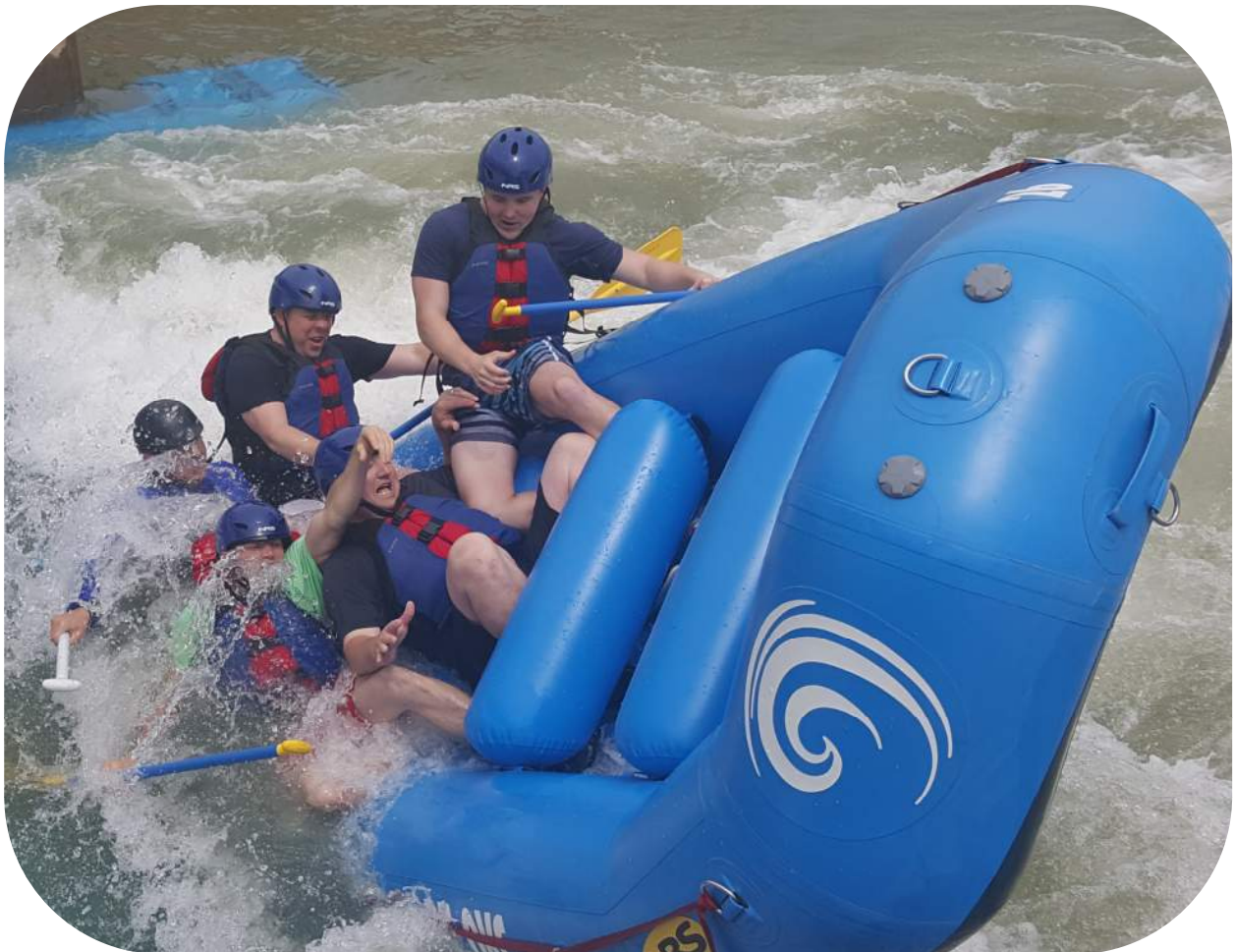
CRC attendees getting the ride of their life at the OKC Riversport Rapids CRC excursion event