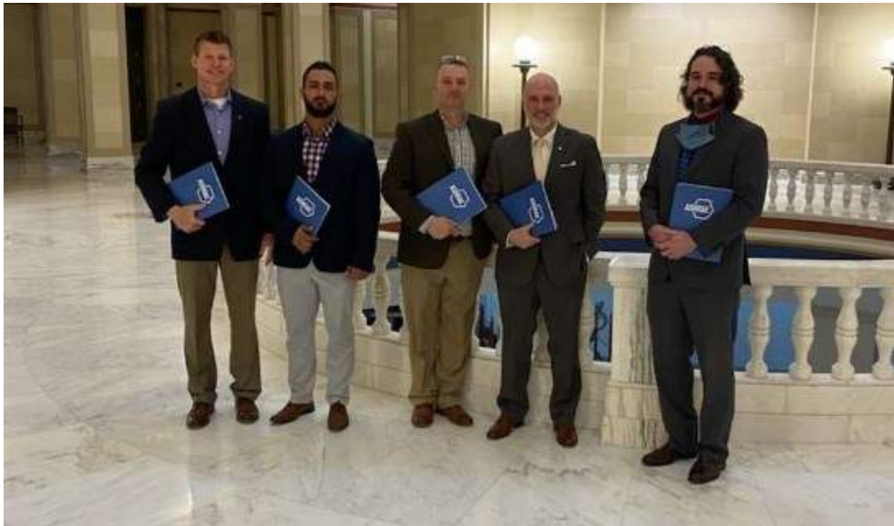
ASHRAE Government Affairs Committee Members at the Oklahoma State Capitol