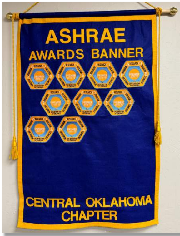
Central Oklahoma – An ASHRAE PAOE Premier Chapter