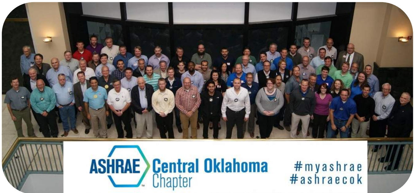
ASHRAE members and guests gather for a group photo during a monthly chapter meeting

The Board of Governors voted this year to create a Vice-President officer position which would automatically be filled by the most immediate past-president. The purpose was not only to improve continuity from year-to-year, but to also provide an additional chair position that contributes to the point total calculation of the Chapter Service Award. The Central Oklahoma Chapter has struggled to award Chapter Service Awards to their past presidents at the rate that other chapters in the region were doing. This is because the chapter didn’t have a vice president position and the fact that the chapter prefers to use the same treasurer year after rather than allowing that chair position to be in the normal officer rotation.