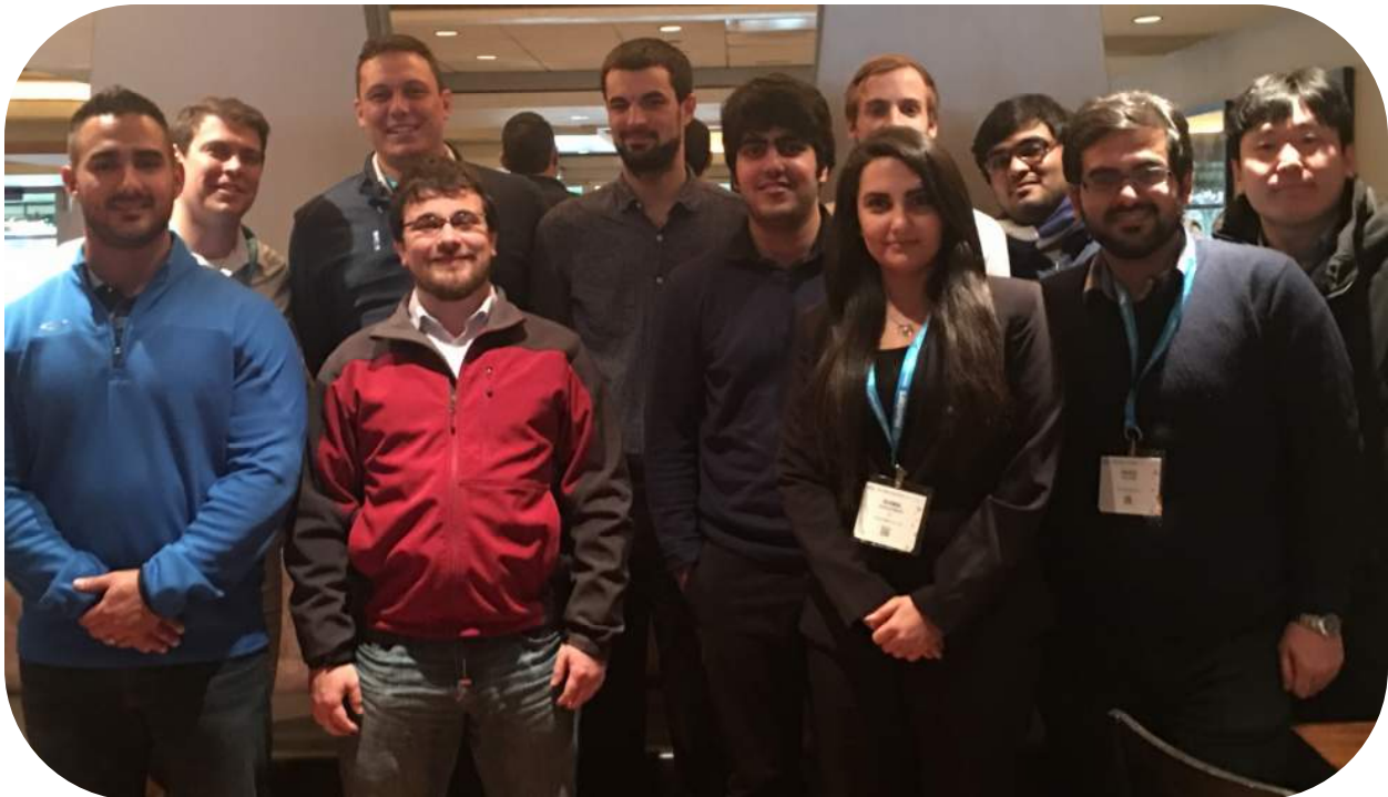
Winter Conference Central Oklahoma Chapter Student Lunch, Jan 22, 2018

Our chapter was truly able to contribute purpose to ASHRAE.”