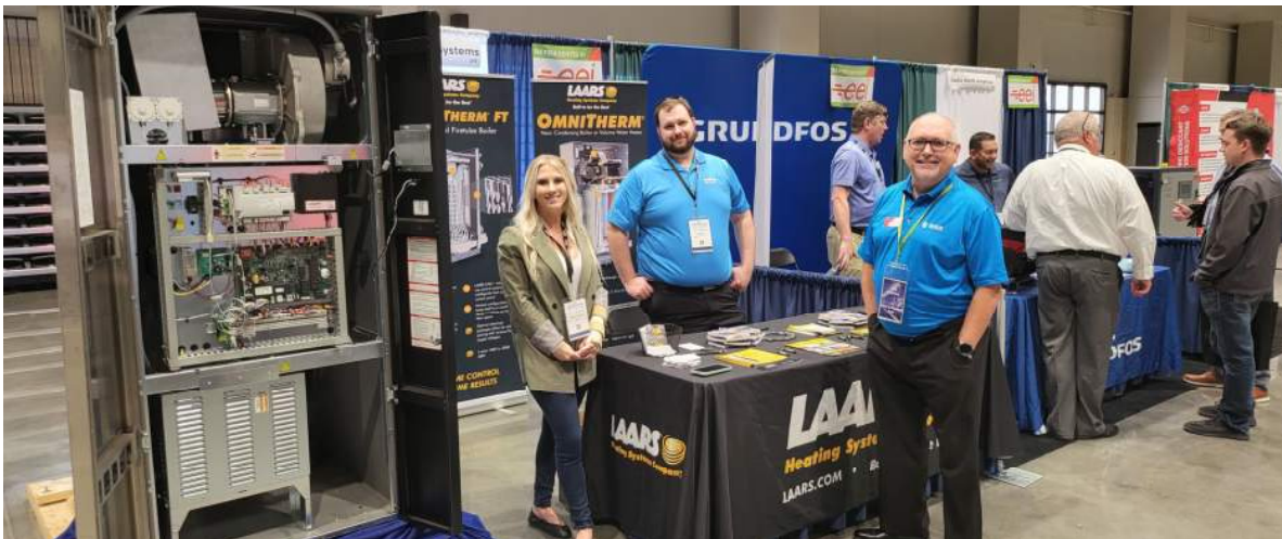
2022 Oklahoma HVAC and Plumbing Expo at the Oklahoma City Convention Center