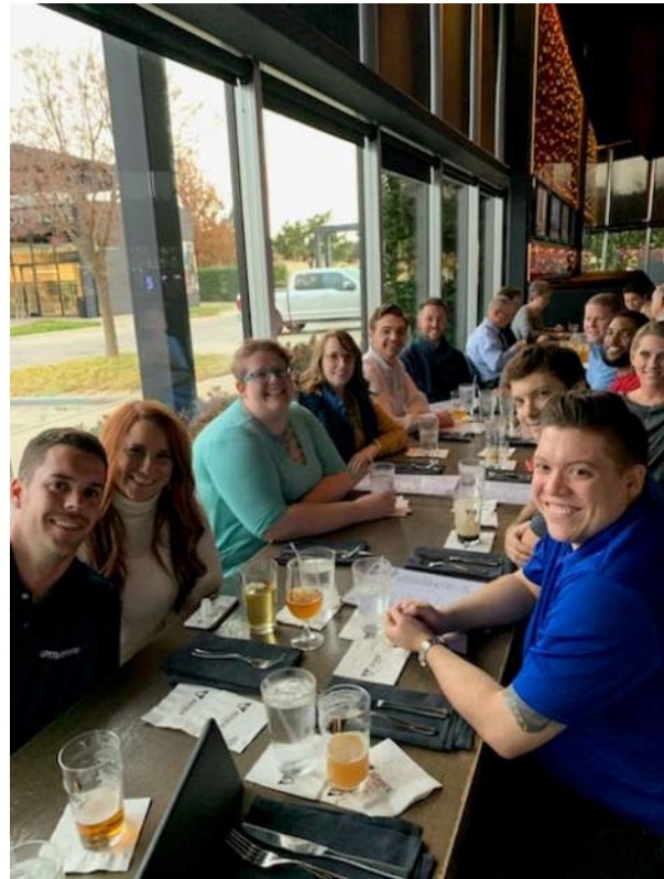
YEA Event in November, 2019