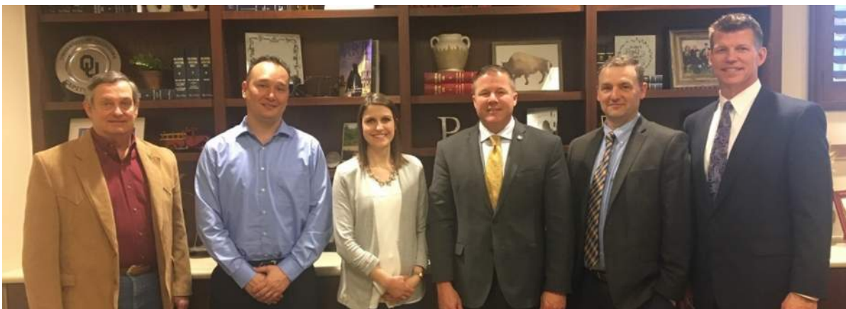
Grassroots Government Advocacy, Day on the Hill. March 12, 2019

GGAC completed its fifth annual Day on the Hill at the Oklahoma State Capitol on March 12th, 2019. Prior to that day, our chapter met in Tulsa with the NE OK Chapter to plan the event. At the event, our team, with 22 participants, received confirmation that certain representatives would put forth a bill to move the state to a more modern energy code. The State has been stuck on the 2006 IECC for a long time. Our group met directly with 26 state legislators.