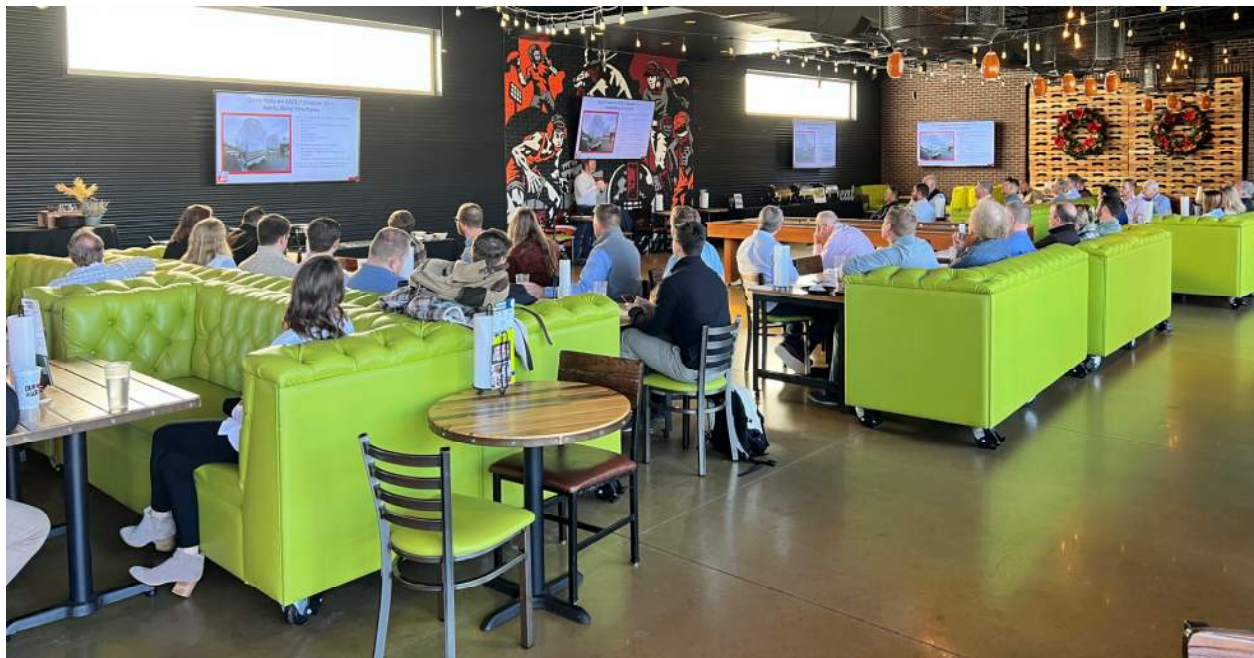
Chapter Meeting at Chicken N Pickle's "Be Amazing" Room

"The guy that was presenting the award might have tipped his hand a little prior to announcing, because he had been as cool as a cucumber all evening, but when presenting this award, he started stumbling over his words a little... When it was announced, I was somewhat surprised... The first thing I did was hug my wife because without her support I would not be able to pursue my passions... The first thing I said for the acceptance was while this award had my name on it, it was the effort of our Chapter that deserved the recognition; my job was simple: empower and encourage those around me to be the best ASHRAE volunteer that they could be."