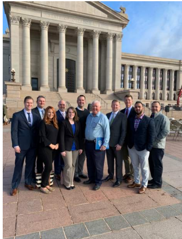
Government Outreach Day, February 25, 2020