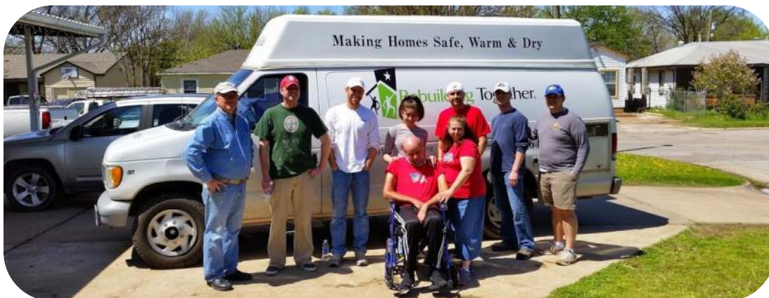
ASHRAE members after working with Rebuilding Together to make improvements to a home including painting, weather proofing and installing a new accessible shower

I really enjoyed my time as Chapter President. I liked working with everyone in our industry and really benefited from the character building and leadership skills. It was a rewarding experience."