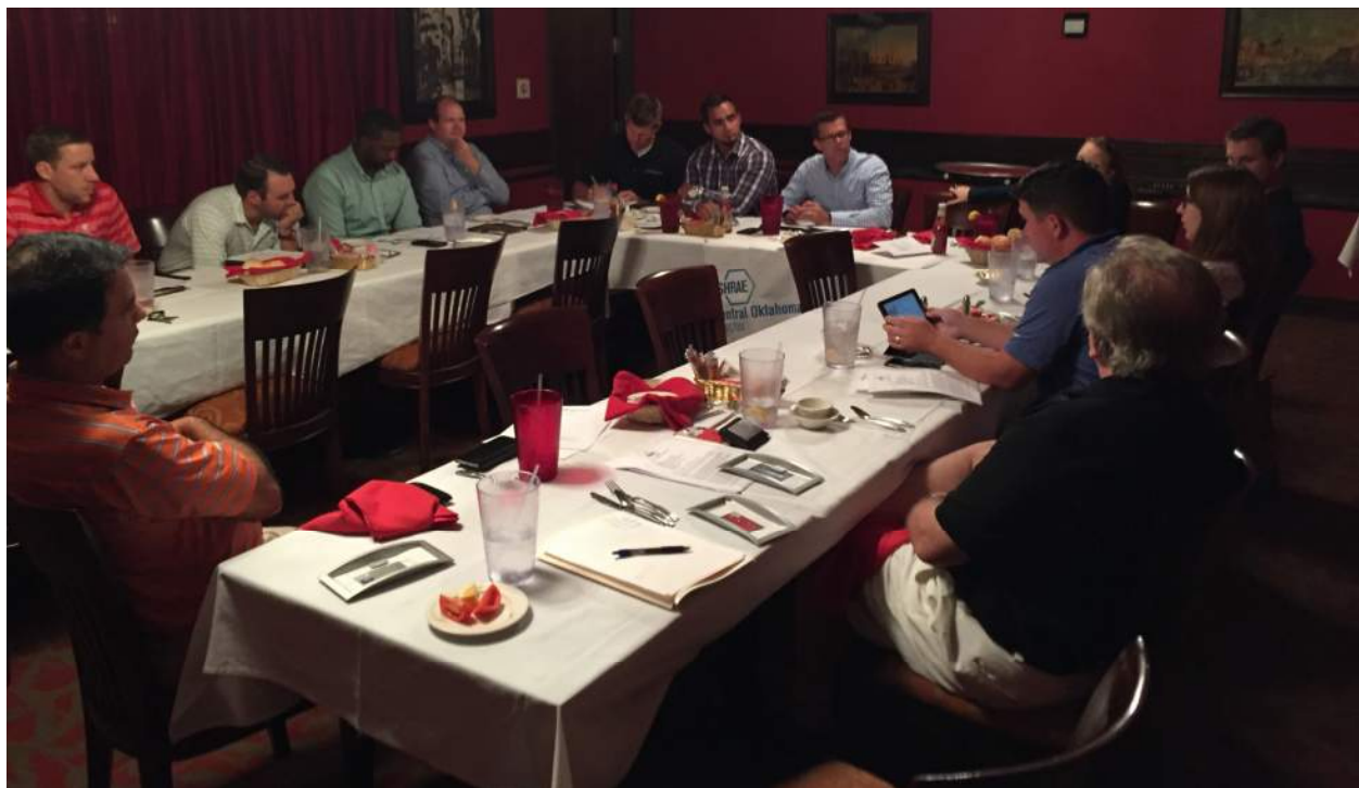
Chapter Board of Governors Meeting at Junior's Supper Club, August 2016

In addition to addressing fundraising challenges, the chapter also focused on improving communication and collaboration. Society started advocating for chapters to utilize Basecamp , a website with features such as calendars, chats and electronic document storage.