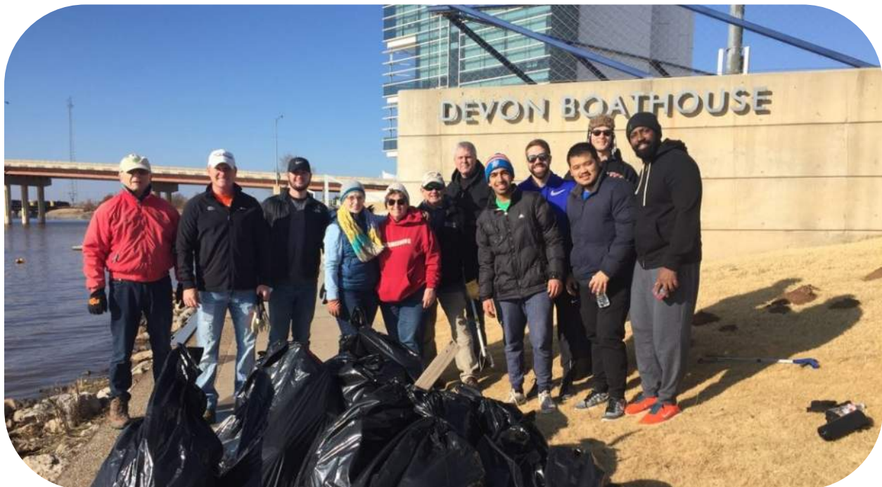
OKC Boathouse Trash Cleanup Day, November 23, 2019

"The Golden Gavel is the highest honor a chapter can achieve, and it is a chapter award. We would not have won it without all of the amazing volunteers that we had this year. Surround yourself with people that have a different skill set and background as you. Actively recruit and engage diverse volunteers and future leaders."