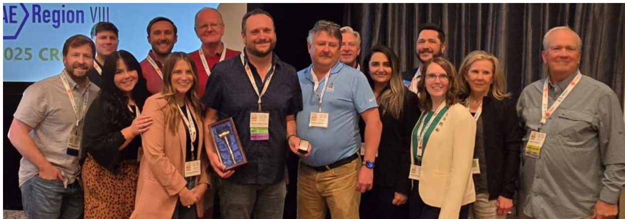
Central Oklahoma chapter members receiving the Golden Gavel award Tulsa CRC, April 2025

"Empower your team—don't try to do everything yourself. Give people ownership and trust them to deliver. Keep the scoreboard visible—set clear goals and track progress so everyone knows how they're contributing to success. And make it fun—whether it's meetings, socials, or fundraisers, people stay engaged when they're learning and enjoying themselves."