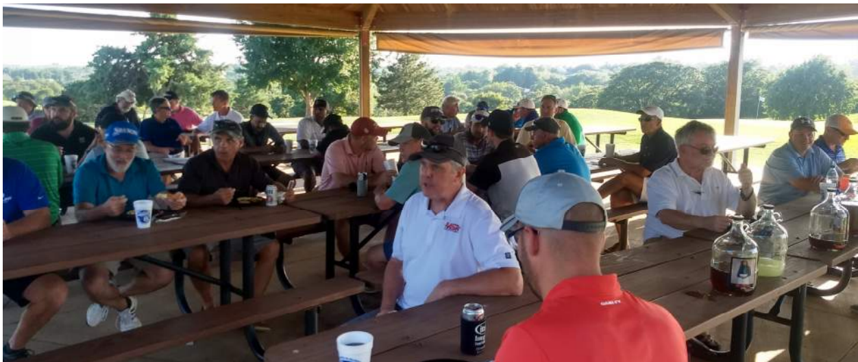
Research Promotion Golf Tournament Fund Raiser at Kickingbird Golf Course, Edmond, OK