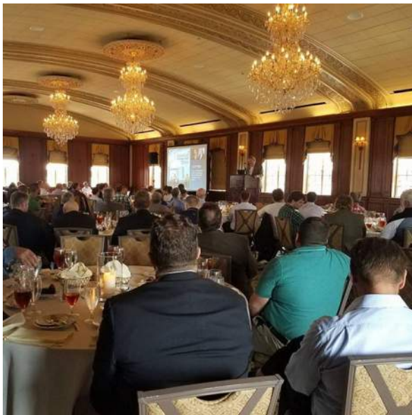
President's Luncheon 2017 Region VIII Chapters Regional Conference Oklahoma City, Skirvin Hotel

The Chapter Technology Transfer Committee (CTTC) started planning with a meeting in the summer with the intent of locking in all chapter meeting presenters for the year. Unfortunately, the task proved too difficult as presenters for the first half of the year were only determined a short time before each monthly meeting. In fact, every newsletter from September to January only listed the upcoming meeting's presenter and topic but then had "TBA" as the presenter and topic for the next meeting. One monthly meeting did not have a speaker. Sometimes, the best intentions just don't materialize. In the end, however, the chapter still had many good speakers for the year. CTTC managed to bring in three Distinguished