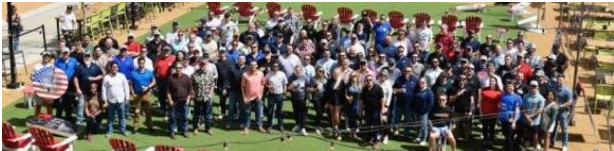
2023 Central Oklahoma Chapter Cornhole Tournament

“Stay involved, be passionate, and have fun above all else. I understand how much work goes into putting together an ASHRAE Chapter President Year and I know it is easy to say “OK, I’m done,” but we need leaders to stay engaged. If you show people that you are committed to doing a great job, others will get behind you. If you aren’t having fun, do something else.”