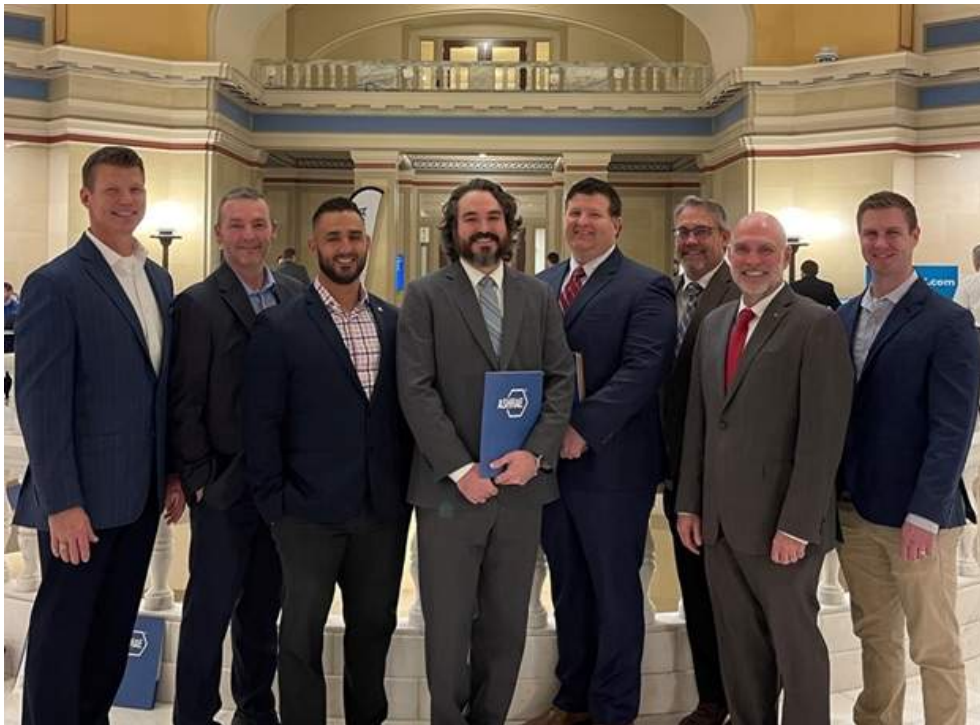
"Day on the Hill" event at the Oklahoma Capitol