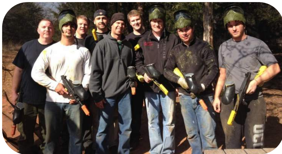
YEA Paintball Event