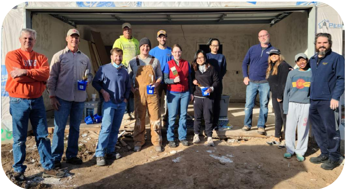
Habitat for Humanity workday, house painting