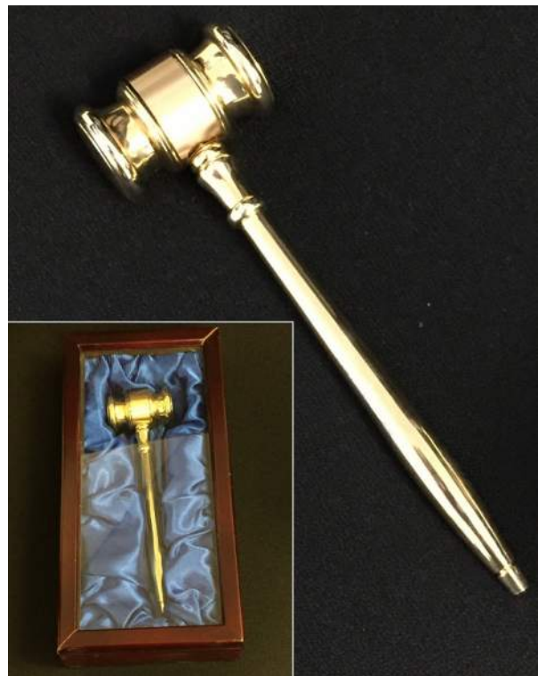
The prestigious Golden Gavel